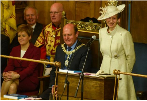
HRH, the Princess Royal