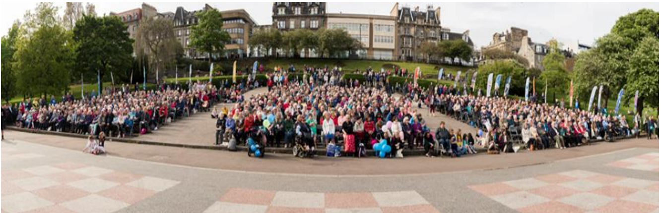
Huge Turnout for Heart & Soul's Closing Worship