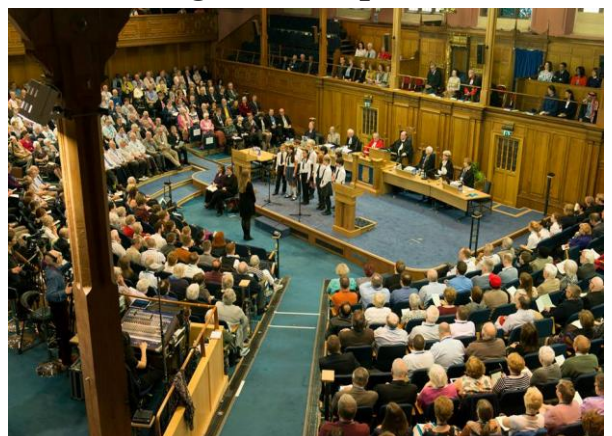
South Morningside Primary Choir