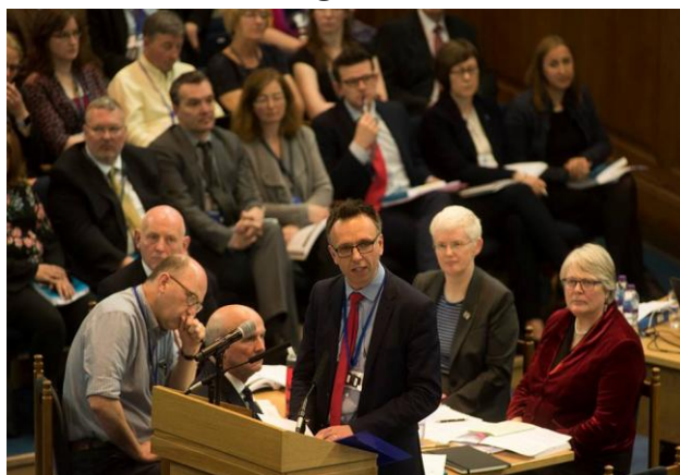
Ministries Council Report