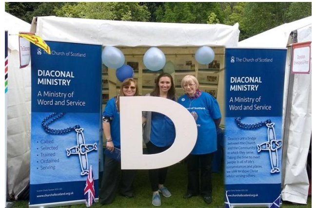
D is for Deacon ( spot ours?)