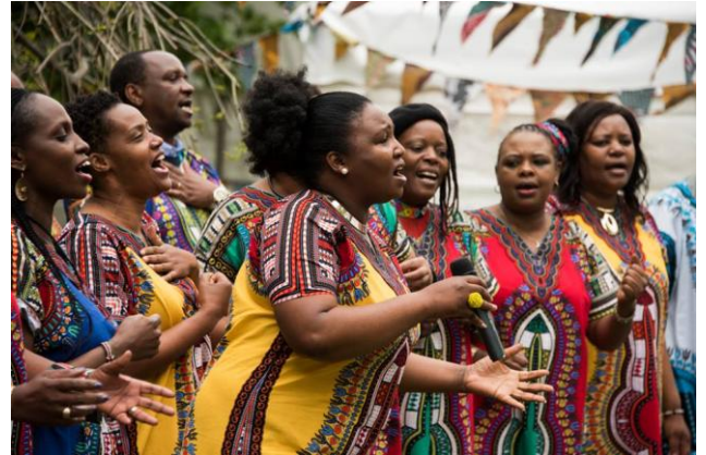
African Choir at Heart & Soul